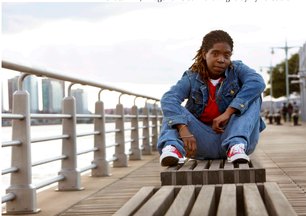
Terrain Hill, image for Out in the Night by Lyric Cabral